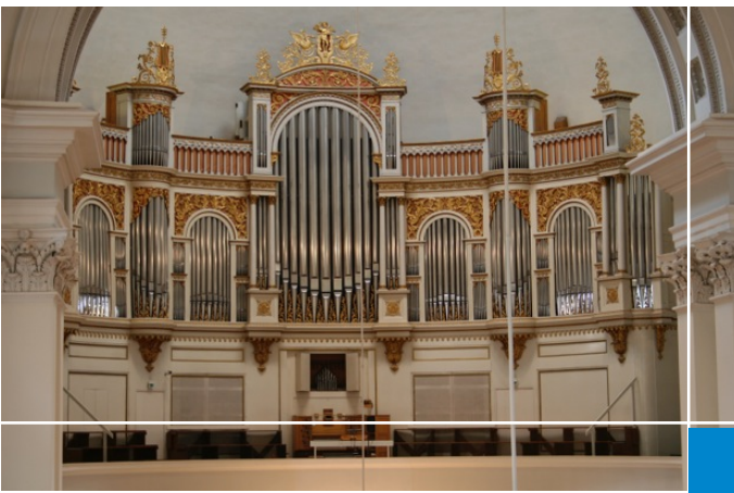
Marcussen & Søn organ (IV/84 ranks) at Helsinki Cathedral