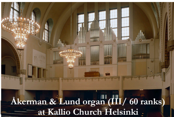
Åkerman & Lund organ (III/ 60 ranks) at Kallio Church Helsinki